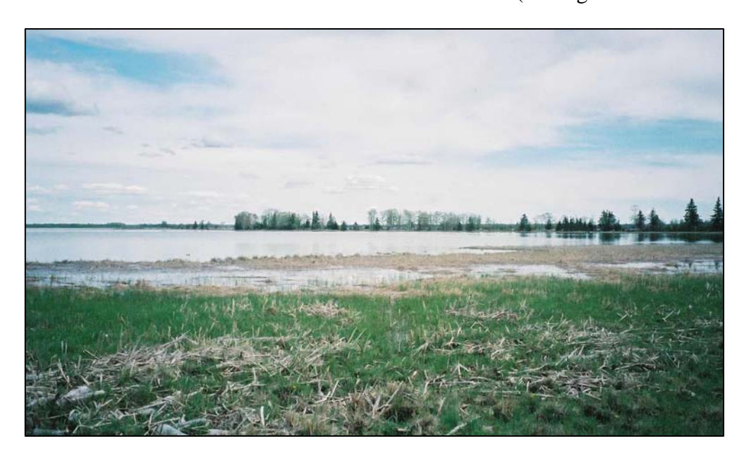
Figure 2: Barnes Lake (East View)

The author worked with the PLFN to conduct a traditional land-use and occupancy study. The research involved conducting a total of twenty-two interviews with community members (see Appendix D: interview Demographics), including twelve male and ten female Elders, hunters and trappers. In the first three interviews the individuals were asked about some of the original inhabitants of the PLFN and how large of an area the people used to travel. Interviewee A2 stated, "[PLFN reserve] [Clearwater, Kawasegamik] right down to Grandpa Wilfred Boon's place [Barnes Lake]. Charlie Bill, one of the original inhabitants of the traditional territory, stated, 'This is my land, this is reserve land, he always claim.'" Interviewee A2 also indicated that some maps at one time showed that the reserve extended south to Barnes Lake (see Figure 1: Barnes Lake).